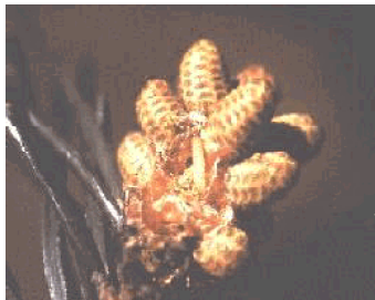
Figure 1. Young budworm caterpillar feeding in a male jack pine flower.

Adult moths are ¾ inch in length and reddish-brown in color, with white markings on the front wings (Figure 3). Eggs are green and laid in masses of about 40 eggs on needles. The eggs remain on needles following hatch, becoming translucent white in color (Figure 4).