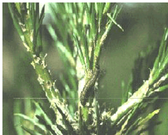
Figure 2. Older jack pine budworm caterpillar.