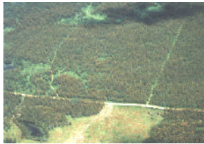
Figure 5. Characteristic reddish color of foliage following budworm outbreaks in July and August.

By mid-summer, clipped needles become reddish as they dry (Figure 5). The more brilliant the red within the crown the more severe the defoliation. Defoliation intensity and the red color is often greatest in the upper canopy. Close inspection of infested trees reveals partially eaten needles, frass, shed skins and pupal cases webbed to needles and shoots (Figure 6). Heavy rain and wind eventually remove the red, dry needles and webbing. Defoliated trees are left with thin crowns. Severely damaged trees appear grayish due to the absence of needles. Evidence of previous outbreaks includes the presence of dead and top-killed trees.