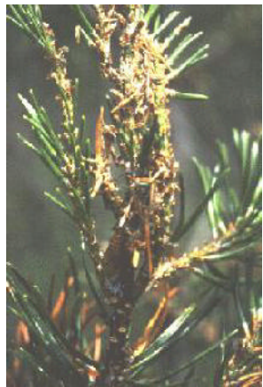
Figure 6. Clipped needles, frass and pupal cases collected in silk webbing.