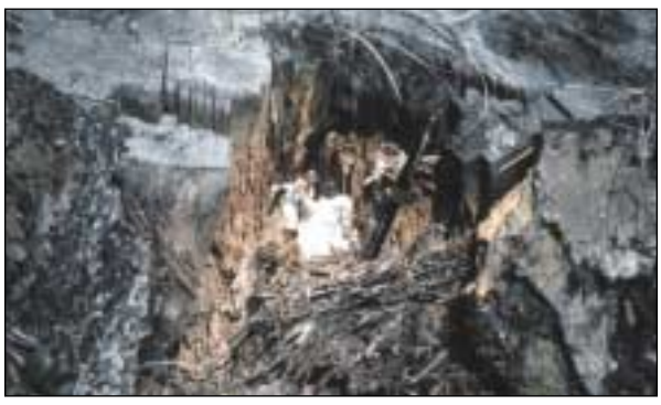
Fig. 3. Mature H. annosum conk in the interior of a ponderosa pine stump