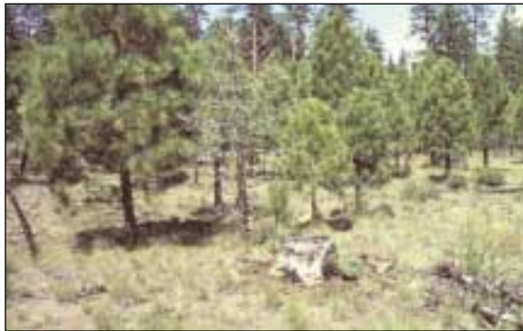
Fig. 11. An annosus root disease center in young ponderosa pine.

but mortality is manifested mainly on the poorer sites. There are indications that H . annosum readily infects pines on better sites but causes mainly growth loss rather