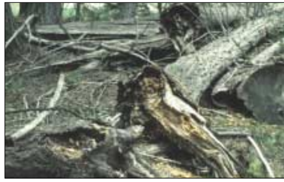
Fig. 9. A small annosus root disease center with several toppled grand fir.

stands on poor, dry sites suffer the greatest impacts (fig. 11). There is some indication from root excavations and stump investigations that infection rates are actually rather high throughout the pine type