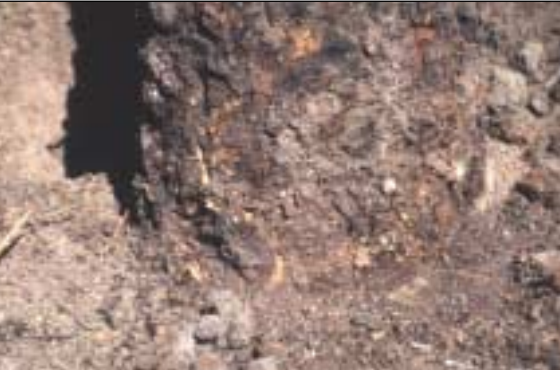
Fig. 1. Small button conks of Heterobasidion annosum on the root collar of a ponderosa pine. Note: these were formed below the duff layer, which was removed for this photograph.

Large conks often grow in the interiors of hollow or extensively decayed hemlock,