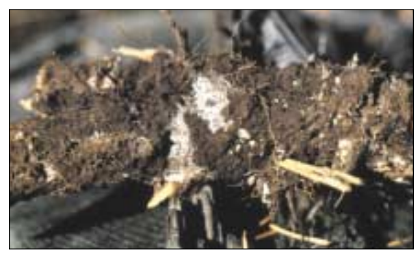
Fig. 4. Ectotrophic mycelia on the exterior of an infected root.