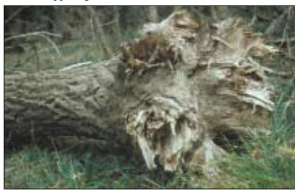
Fig. 10. A recently toppled H. annosum infected grand fir with extensively rotted roots showing the characteristic laminated decay.