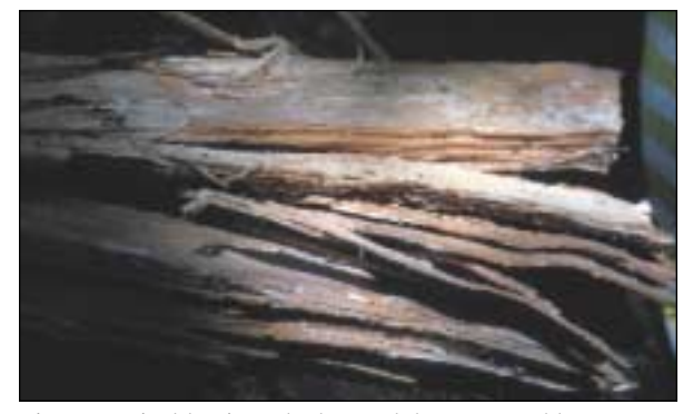
Fig. 6. Typical laminated advanced decay caused by H. annosum.

A light, tawny-brown colored fungal growth may be found on the exteriors of infected roots of pines, true firs, and Douglas-fir (fig. 4). This serves as the primary mechanism for root to root spread, growing along the surface of roots and moving onto the roots of adjacent trees across contacts and grafts. Some other root disease fungi form similar mycelia, and its occurrence alone cannot be used to diagnose the disease.